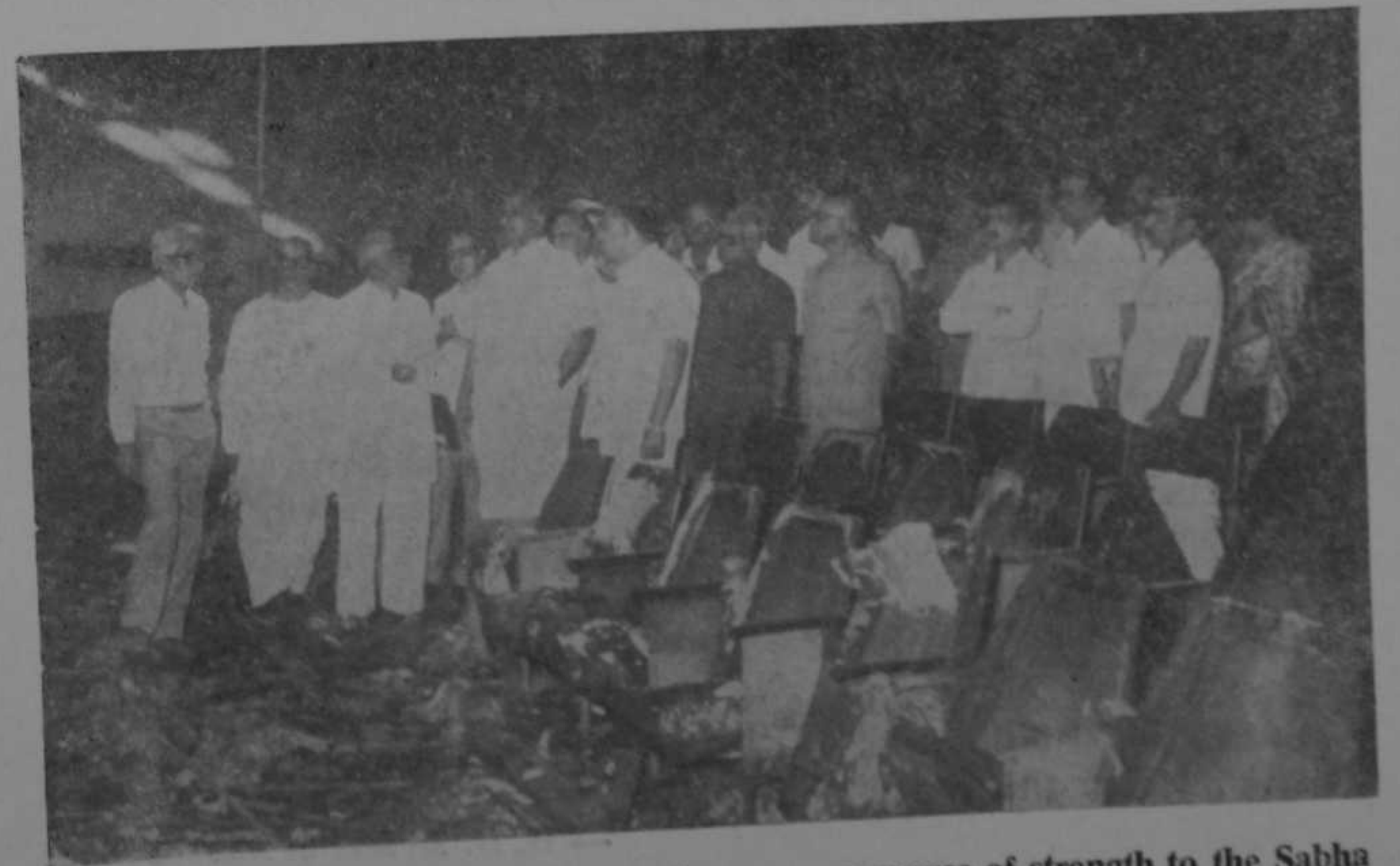
Maharashtra CM Sharad Pawar inspecting . . . a source of strength to the Sabha